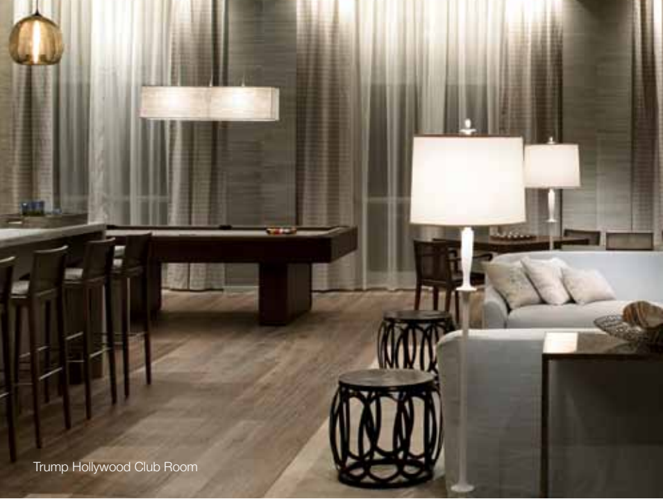
Trump Hollywood Club Room