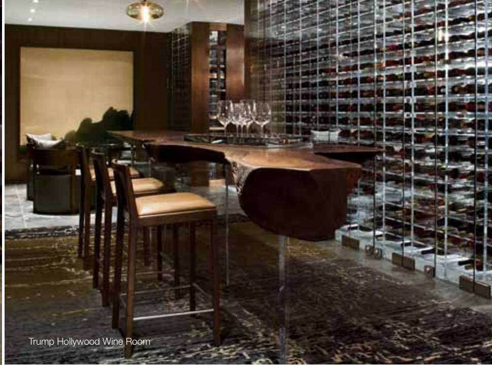
Trump Hollywood Wine Room