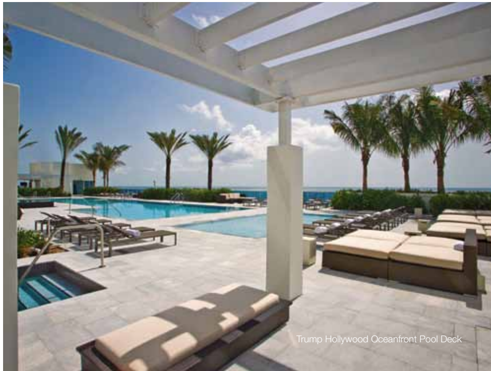
Trump Hollywood Oceanfront Pool Deck

In keeping with the superior quality of the property, The Developers are proud to associate the property with the Trump name and brand through an exclusive licensing agreement with Trump Marks Hollywood LLC. To the discerning buyer, Trump branding signifies the highest standards of luxury, quality and service in premier real estate developments throughout the world.