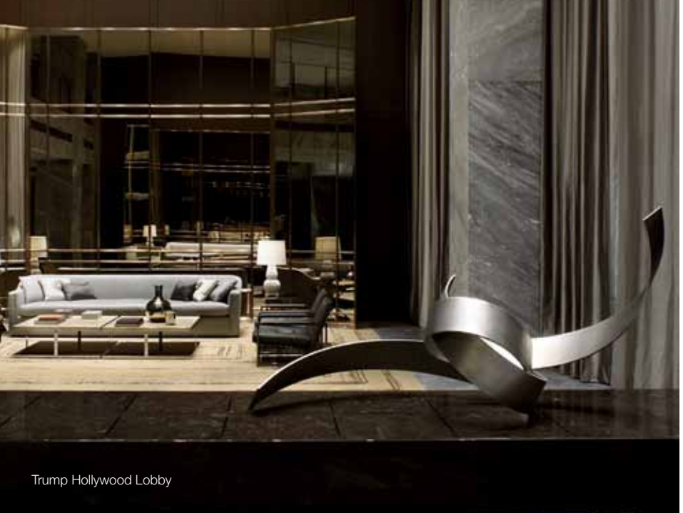
Trump Hollywood Lobby