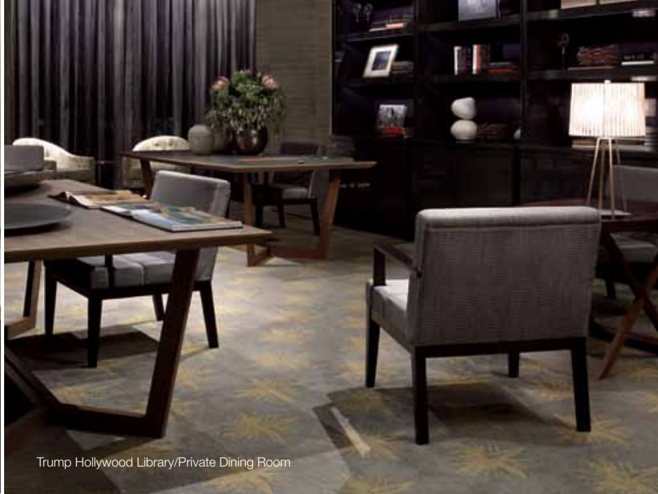
Trump Hollywood Library/Private Dining Room